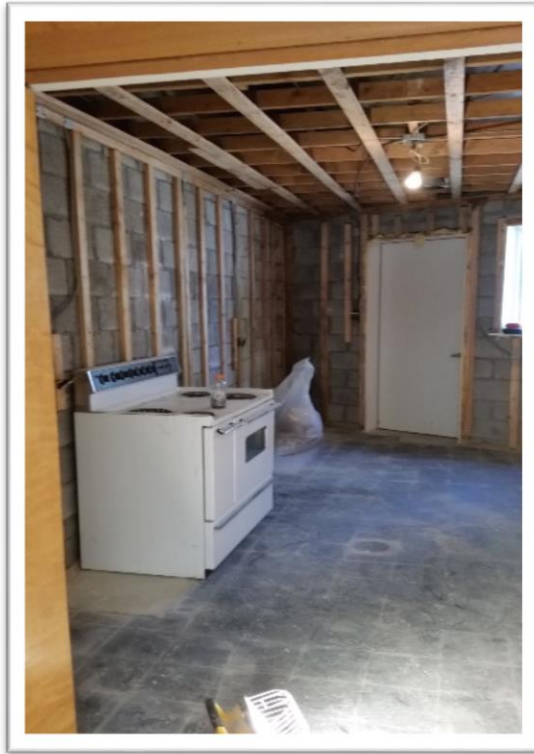
Above is the kitchen being gutted and afterwards. The old stove is now gone. Below is what is left of the wall between the kitchen and what was the bathrooms.